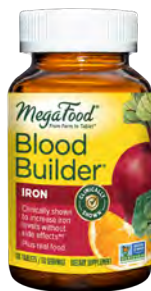
MegaFood Blood Builder

MegaFood is a certified B Corporation and proud member of 1% For the Planet. We believe that nature and science work best together. That's why we are dedicated to crafting plant-powered supplements that nurture the health of people and our planet.