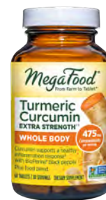
MegaFood Turmeric Curcumin Extra Strength Whole Body