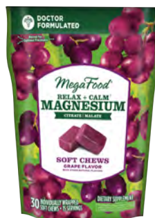
MegaFood Relax + Calm Magnesium Soft Chews